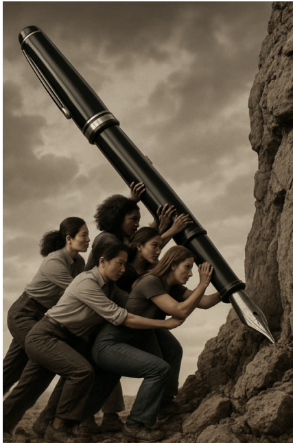
In the Spirit of the times , this is Sora AI's impression of women writers...

If you're reading this, then thank you for the precious time you are giving me, and us for this performance and theater in general and The Hollywood Fringe in specific. Theater doesn't make us human, it celebrates our humanity. And I'm grateful to be celebrating it with you.